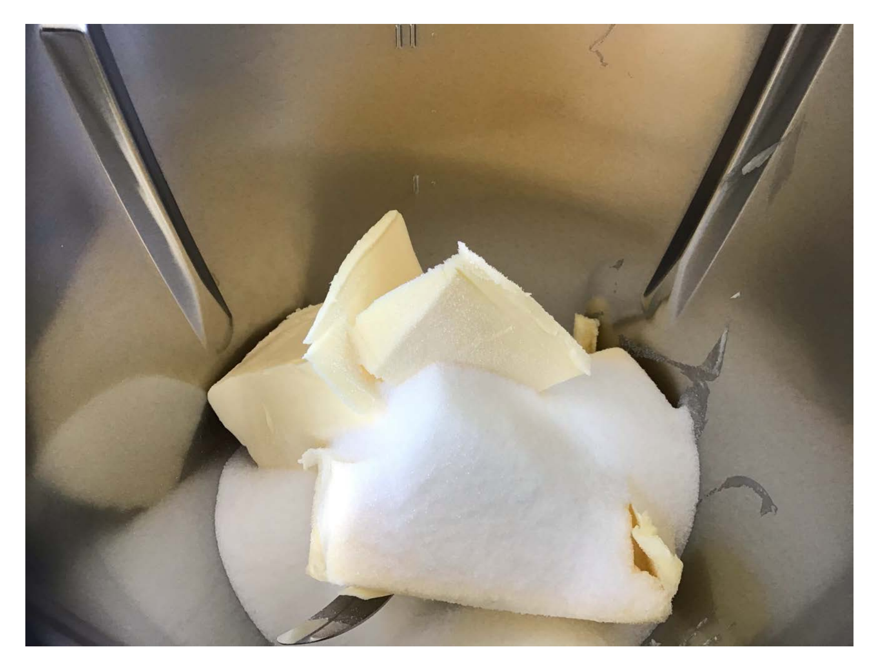
Step 3 : Add the sugar, mix well