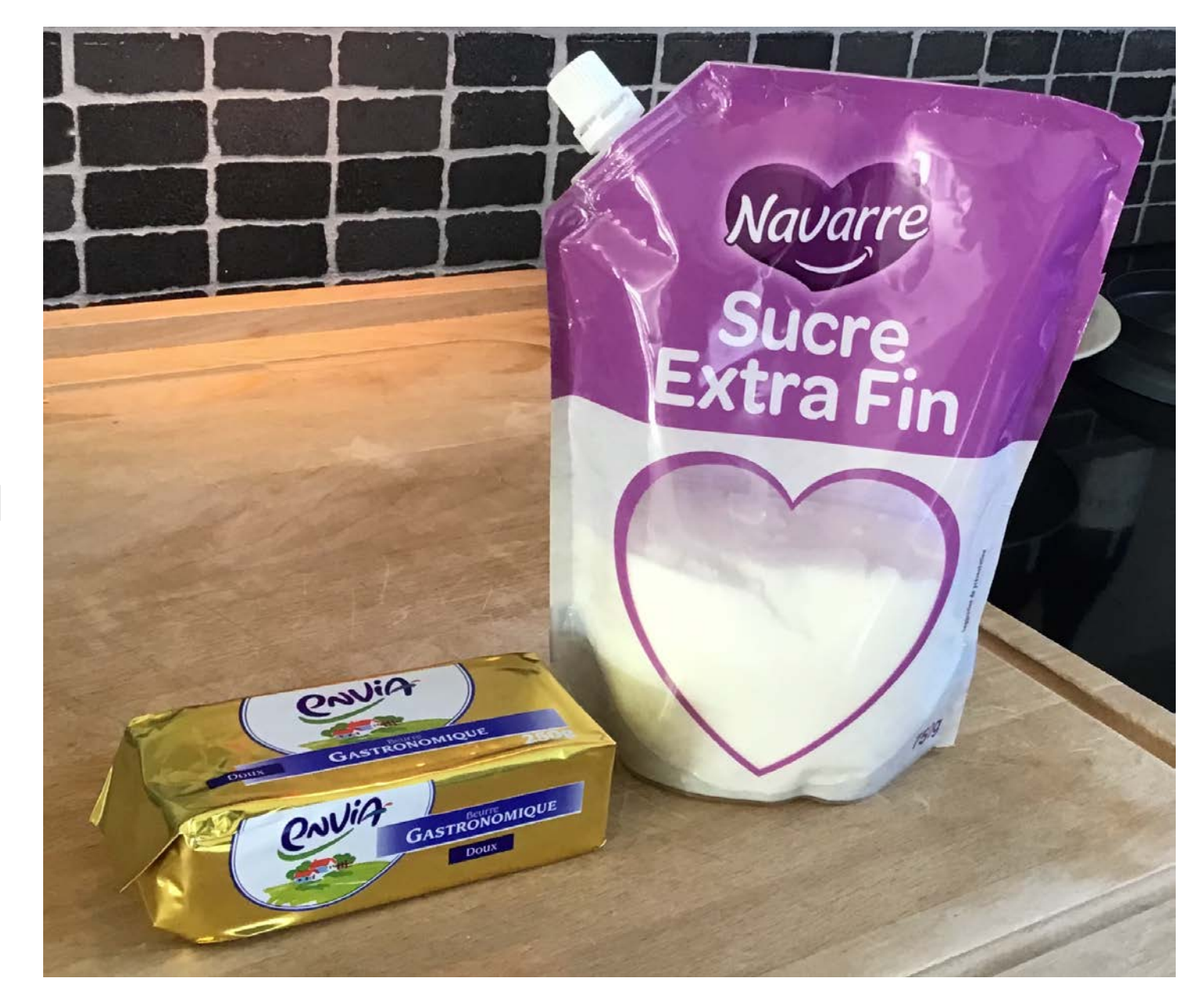
Step 1 : You need 200g butter and 200g caster sugar